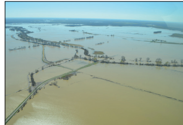
Low-Water Bridge Road