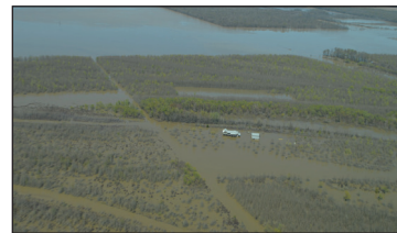
Cabin & Land underwater west of Carey, MS