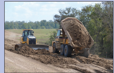
511L - Placing and Spreading Material

Levee Enlargement Project Update: Completed Work – 44 miles Items 468L, 474L, 477L, 488L, 496L, 502L & 509L On-going Construction – On-going Construction (8.8 miles): Item 463L – 2.7 miles – 97% Complete Item 511L – 3.4 miles - 99% Complete Item 465L – 2.7 miles - 56% Complete Future work remaining – 16.2 miles