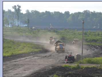
465L - Hauling Material

Levee Enlargement Project Update: Completed Work – 44 miles Items 468L, 474L, 477L, 488L, 496L, 502L & 509L On-going Construction – On-going Construction (8.8 miles): Item 463L – 2.7 miles – 97% Complete Item 511L – 3.4 miles - 99% Complete Item 465L – 2.7 miles - 56% Complete Future work remaining – 16.2 miles