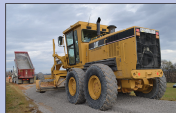
2017 - Levee Board spreading gravel

areas that need maintenance and will assure that we have adequate access for flood fight activities in the event of a high water. ■