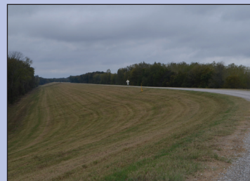
468L - Finished Turf