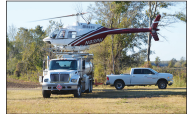
2017 - Helicopter fueling

In the Fall of 2018 the Mississippi Levee Board treated 148.7 miles of its interior streams. This included 1,500 acres of interior streams located primarily in the northern half of the Mississippi Levee District. Airbourn Aviation sprayed on October 4-12, 2018. Streams treated this year included Big Sunflower River, Bogue Hasty, Bogue Phalia, Clear Creek, Hushpuckena River, Snake Creek, Valewood Ditch and Dowling Bayou. ■