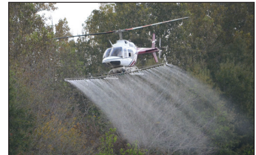
2017 - Helicopter spraying