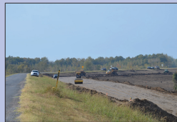
465L - Riverside Levee Enlargement