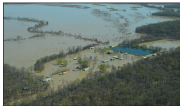
Goose Lake Road