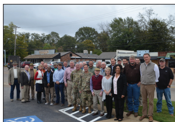
Members of the 2018 Annual Levee Inspection take a photo in front of Sherman's Restaurant.

Lunch was served at Sherman's Restaurant. ■