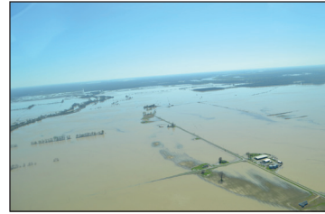
Goose Lake Road

In 2008 the Yazoo Backwater Project would have cost $220M to build the 14,000 cfs Pumping Plant and pay for the 55,600 acres of reforestation. At this point the project would have paid for itself and would have saved the government over $150M in damages. ■