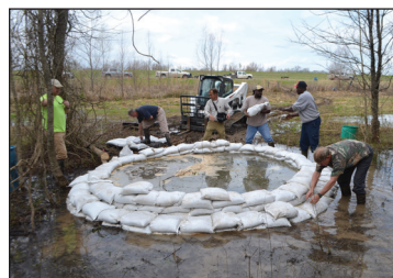
Crew sandbagging boil at Sta. 7097 at ATCO Woods

Inspectors discovered sandboils again at the ATCO Woods just north of the Ben Lomond Relief Wells from Sta. 7090 to 7150. We had to install numerous barrels and build a sandbag ring around a large sandbail. We have requested that the Vicksburg District investigate this area to determine if relief wells need to be installed to prevent these sandboils. The Washington County Emergency Management and Road Department filled and stockpiled sandbags on pallets for our use. Anytime the crew needed sandbags all we had to do was go load up the pallets on our trailers. This provided a tremendous service and was greatly appreciated.