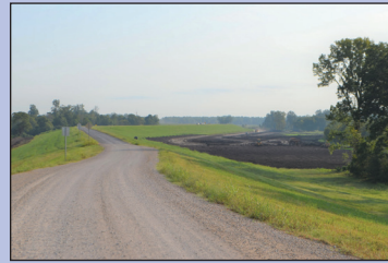
465L - Landside Berm Construction

The Levee Board has also provided right-of-entry for surveys and borings for Item 543L - Above Greenville Seepage Control Project (6.2 miles). The Levee Board is working on acquiring right-of-way for Item 524L - Avon Seepage Control Project (0.6 miles). ■