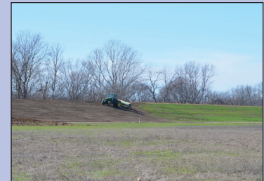
511L - Planting Grass Seed on Enlarged Levee