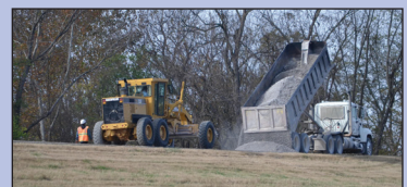
2017 - Gravel being dumped