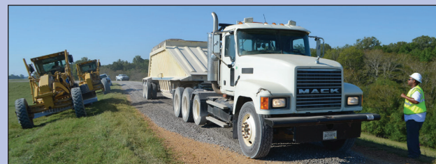
2018 - Gravel job