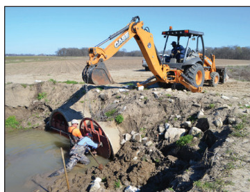
Crew Installing Culvert Weir in Valewood Ditch

Inspectors discovered sandboils again in the bottom of Valewood Ditch. We had to install all four Culvert Weir Inserts in the double-barrel culverts at Sta. 6305 & 6330 and the Box Culvert Weir Insert at Addie at Sta. 6367. These Weir Inserts were built by Tim Hovas with New South Marine and they again worked perfectly by adding 18" to 24" of additional water over the top of the sandboils in the bottom of Valewood Ditch. The inserts also saved the Levee Board Crew a lot of time with their quick installation and removal.