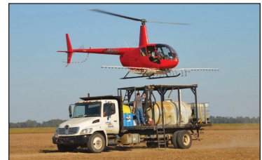
2018 - Helicopter loading chemicals