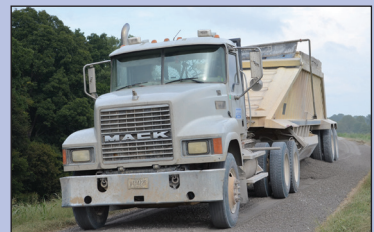
2018 - Gravel being dumped