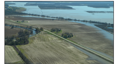
Hwy 61 at Valley Park, MS