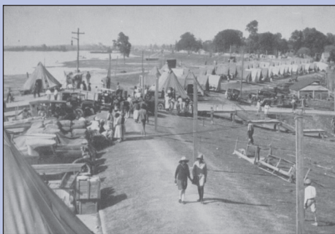
1927 Flood - Main Street in Greenville

No levee existed at the City of Greenville's river-front until after the 1897 Flood. While that seems inconceivable today, in 1882 the average height of the levee north of Greenville was 8.05 feet. The 1883