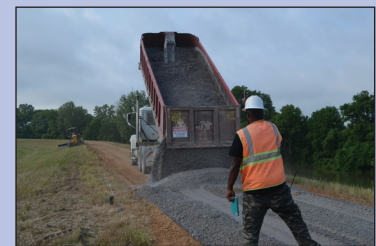
511L - Placing New Limestone