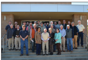
Members of the 2017 Annual Levee Inspection take a photo in front of Harlow's Casino.