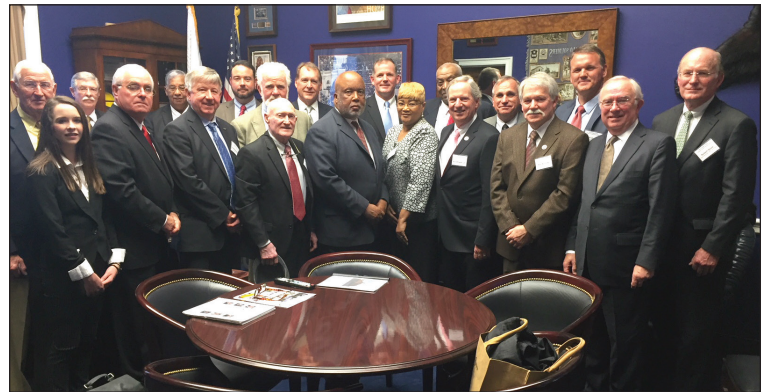
Congressman Bennie Thompson with the MS Levee Board and YMD Levee Board