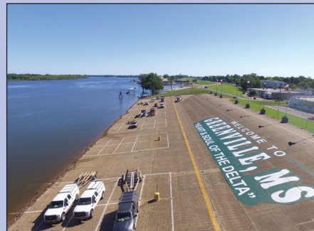
Aerial - Greenville City Front

Mississippi River Commission Map of the Mississippi River shows the levee tying into the River leaving over a 4 block stretch of City Front that was open to the River from approximately Roach Street to Union Street. An 1896 Greenville map shows the levee tying into the River on the north end just like the 1883 MRC Map.