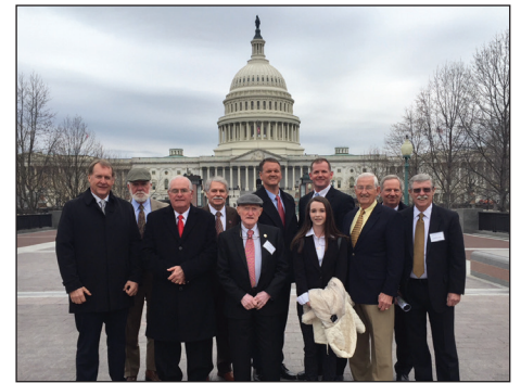
MS Levee Board & Greenville Port in front of U.S. Capitol