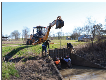
Crew Installing Box Culvert Weir in Valewood Ditch

On February 26, 2018 the National Weather Service predicted that the Greenville Gage would crest at 55' on March 12, 2018. A Phase I Flood Fight Organizational Meeting was held at the Levee Board office on February 28, 2018. Levee Inspectors from the U.S. Army Corps of Engineers and the Yazoo-Mississippi Delta Joint Water Management District started inspecting the levee on March 5th.